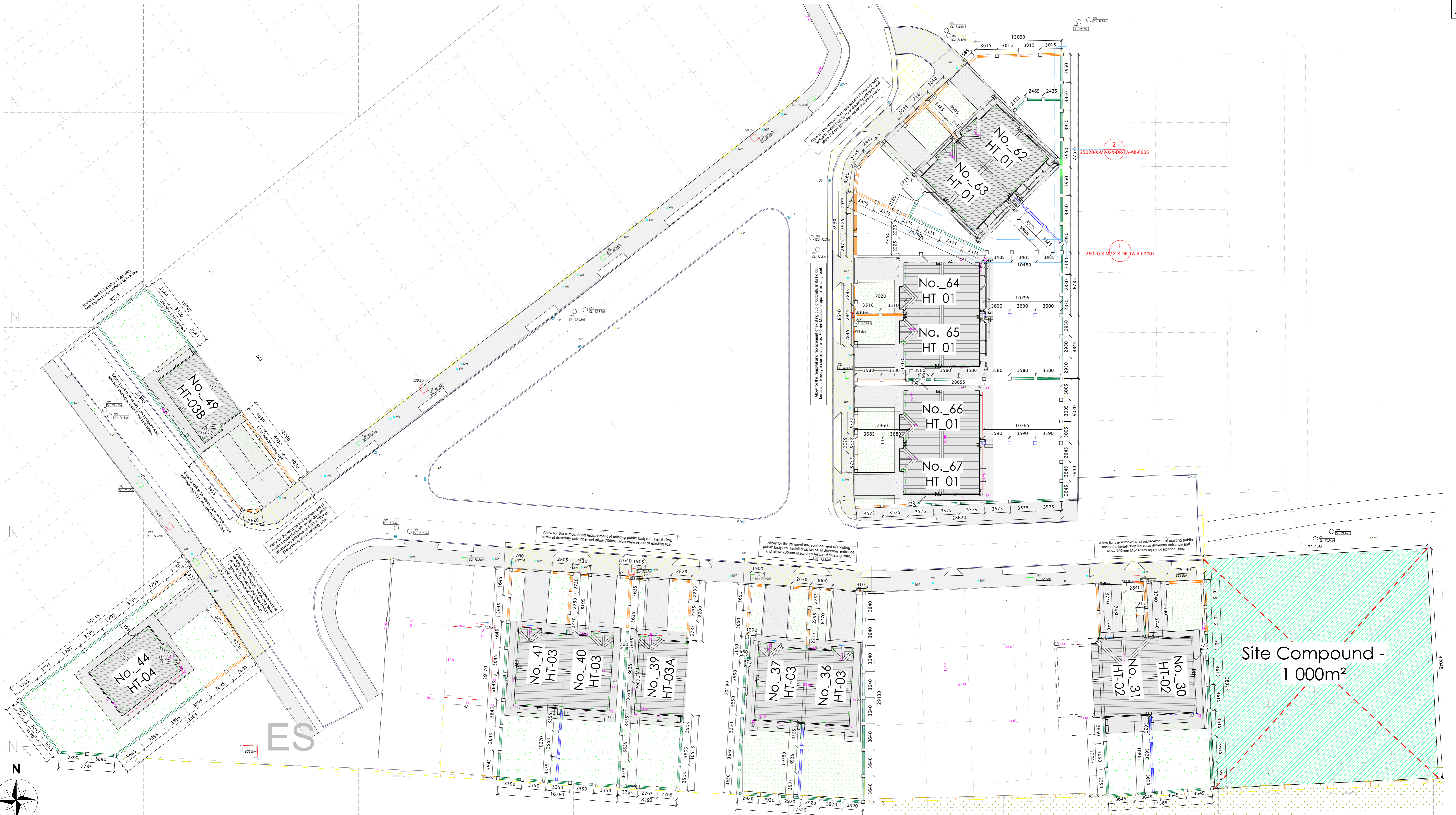
2 Overall Site Plan 1:250